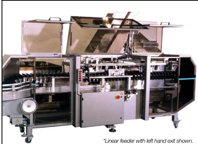
*Linear feeder with left hand exit shown.

Designed for Multiple Bottle Applications