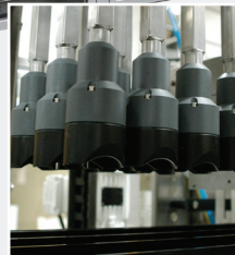
Positive Placement Packing option for lightweight or pressure sensitive products

Since its inception, the Hartness Model 2800 servo case packer has been the global industry standard for high speed, top load case packing. Today, the Model 2800 is more advanced, yet more simple than ever. Closed loop positive control Allen Bradley servo motors drive all of the machine's major axes. The servo motors precision control enables quick and repeatable changeovers, greater speed, more gentle product handling and increased flexibility. The 2800 servo design delivers a smoother operation, with increased control compared to pneumatic systems. The result is increased OEE with a decrease in long term cost of operation.