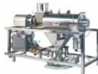
Screener in pharmaceutical design with frame