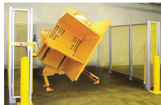
BOSCH GUARDING: Guarding which bolts directly to the floor with removable panels for maintenance access