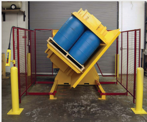
EASILY TRANSFER DRUMS FROM ONE PALLET TO ANOTHER