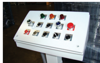
CONSOLE: Offers added operational features to provide maximum control of machine