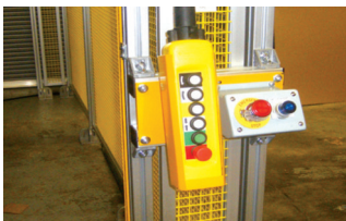
PUSH BUTTON: Comes on a 30-foot cord with E-stop, lock out tag/out and pendant holder