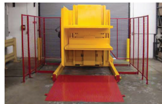
HIGH STYLE GUARDING: Provides additional protection for forklift operators (mounted directly to the machine)