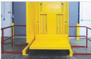
STANDARD MACHINE GUARDING: Provides protection from forklifts