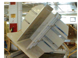
CUSTOM-SIZED TABLE: Larger and smaller platforms available for custom-sized loads