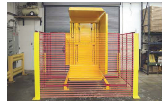
LIGHT CURTAINS: Provides a soft guarding across the front of the machine for additional protection