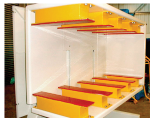
STAND OFFS: Allow for pallet-less loading and unloading