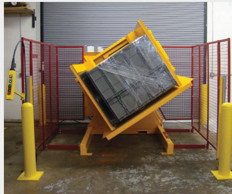
EASILY TRANSFER TOTES OR ANY OTHER REUSABLE PACKAGING FROM WOOD TO PLASTIC