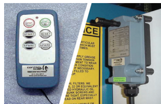
WIRELESS REMOTE: Receiver mounts to machine