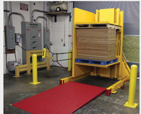
EASILY TRANSFER CORRUGATE FROM A WOOD PALLET TO A PLASTIC PALLET