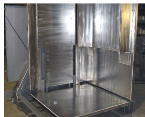
CUSTOM PAINT FINISHES: Stainless Steel, food-grade Steel-It, and custom color match paint