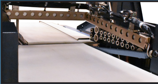
Detail showing the L-Bar Sealer

Fusing Tomorrow's Shrink Packaging Requirements with Today's Budgets