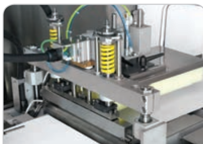
Box Motion sealing head for a great flexibility