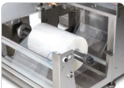
Front loading reel holder for an easy access