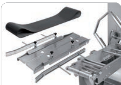
Tool-less detachable in-feed conveyor