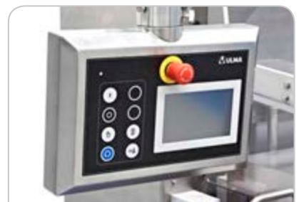
Touch screen control panel on a swivel arm