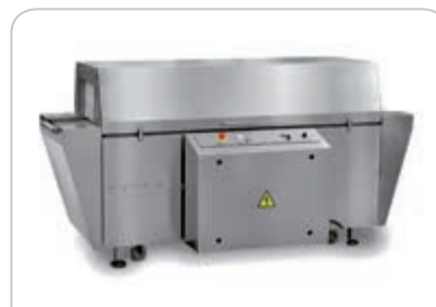
Openable top cover shrink tunnels