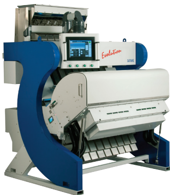
Evolution 400 & 800