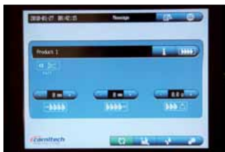
New userfriendly user interface