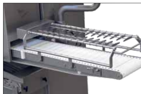
New built in pre weight scale