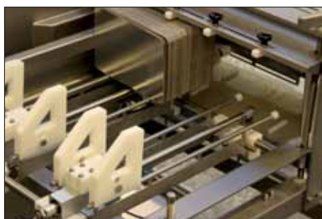
New flexible board dispenser