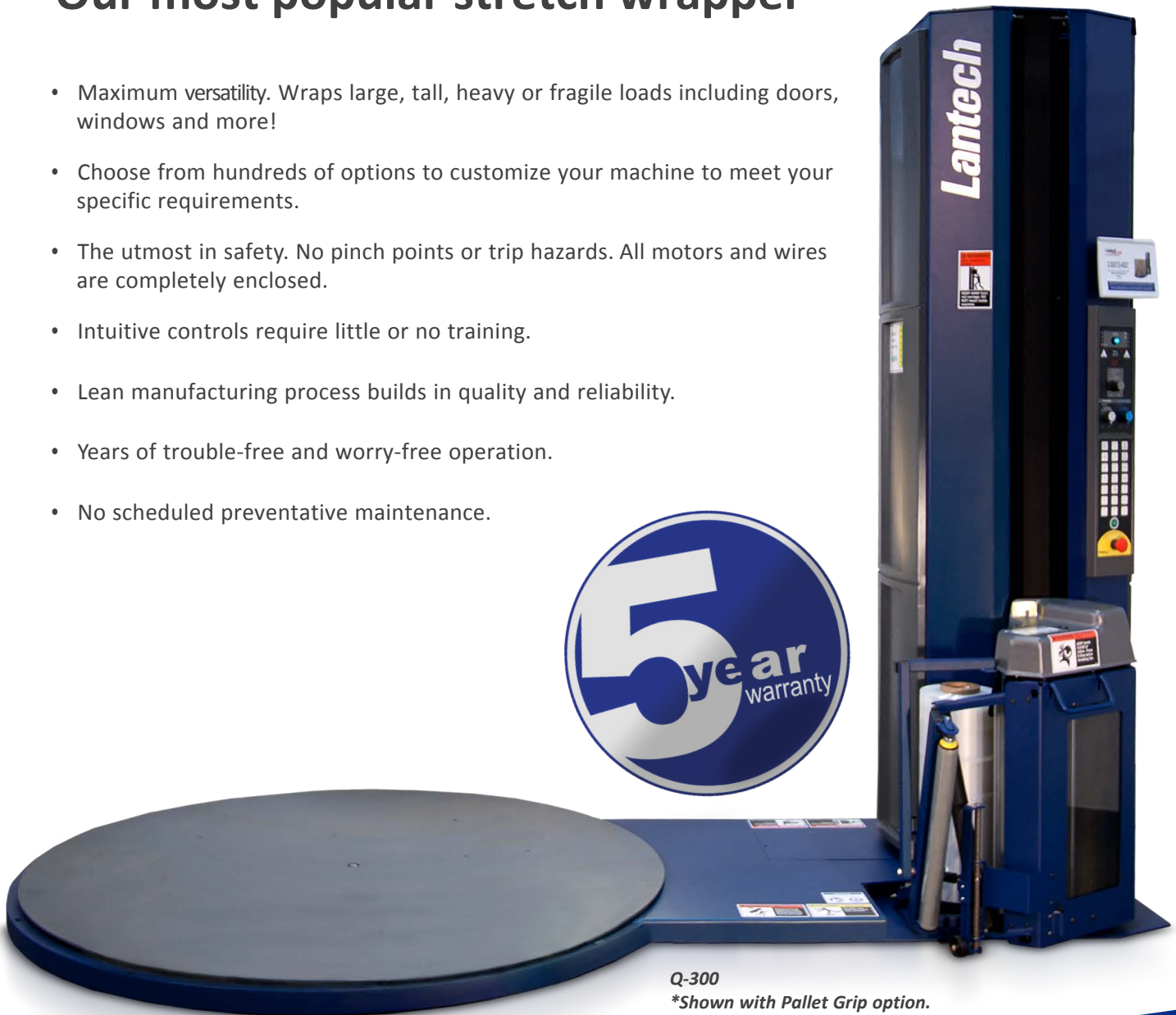
Q-300 *Shown with Pallet Grip option.