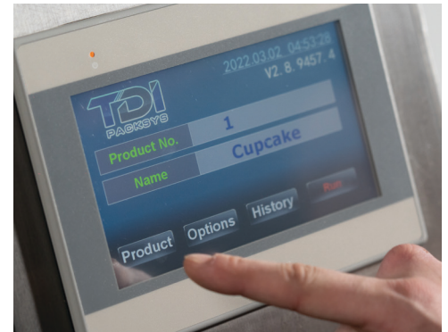
Operator friendly LCD touchscreen HMI – save programs for over 100 products.

IMD Conveyorized Metal Detectors are perfect for the inspection of any product without metallic packaging. By integrating the metal detector probe head onto a specially designed conveyor, you can seamlessly incorporate this plug-and-play inspection technology into your production process. Being able to inspect both packaged and unpackaged products, conveyorized metal detectors can fit most production applications with little to no modification.