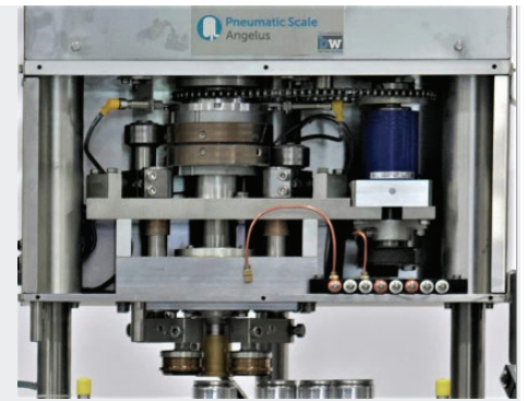
Seaming Cam and Levers