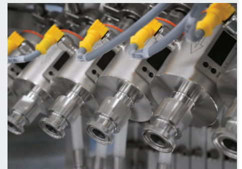
Magnetic Flow Meter Technology

Angelus | Burt | Carr Centritech | Consolidated | Continental/Closetech Hema | Mateer | Multi-Tech Systems | OnTrack | Zepf Solutions